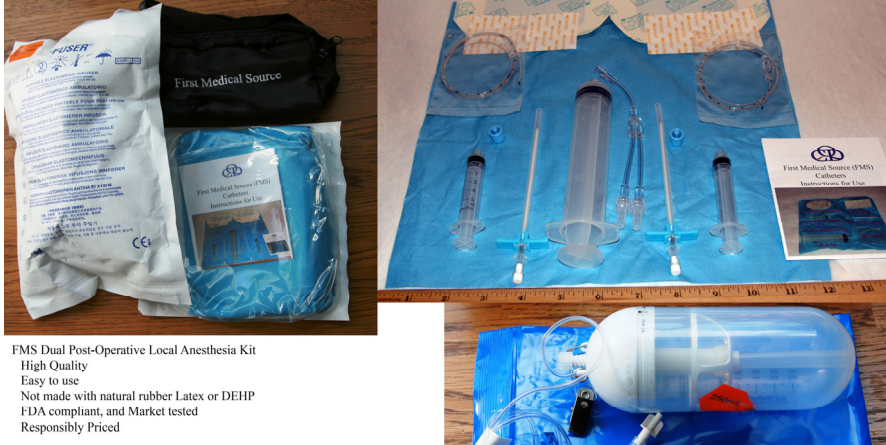
FMS Dual Post-Operative Local Anesthesia Kit High Quality Easy to use Not made with natural rubber Latex or DEHP FDA compliant, and Market tested Responsibly Priced